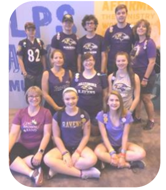
2018 ELCA Youth Gathering Houston, TX

We currently have a group of 12 youth and three adults planning to attend in 2022. The cost per person is approximately <sup>$</sup>1,000 per person, which includes: all transportation, lodging, registration, and food. Our goal is that the only out of pocket for our attendees is the registration deposit. We have been fundraising for over three years by selling snowballs at our monthly flea markets, Hosting Mario's Italian Restaurant, Gertrude Hawk Chocolate Sales, Soup & Sandwich Fellowship, Mario's Memorial Day Weekend Pre-made Meals, and In-kind donations.