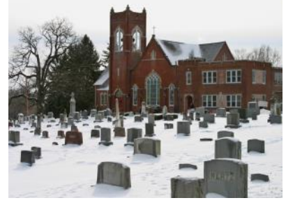
Immanuel Lutheran Church December 19, 2020

Immanuel Lutheran Church was honored to host our first "Wreaths Across America" commemorative program on Saturday, December 19, 2020. We honored over 300 veterans by placing wreaths at their graves. Immanuel is very grateful for the help and support from our community and congregation. We look forward to hosting in 2021.