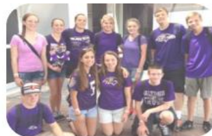
2015 ELCA Youth Gathering Detroit, MI