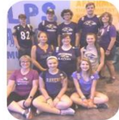
2018 ELCA Youth Gathering Houston, TX