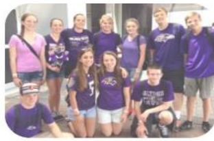
2015 ELCA Youth Gathering Detroit, MI