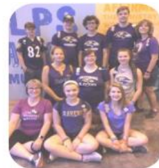
2018 ELCA Youth Gathering Houston, TX